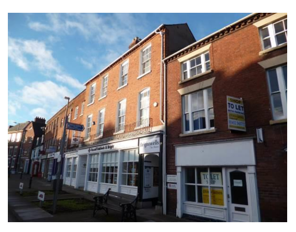
Fig.6: north side of King Street and the passageway to the meeting house (centre)

right angles to Broad Street. The river Wye is to the south of the city centre. The meeting house is not visible from King Street and access to it is along a passage off the north side of the street, below late Georgian brick buildings. Facing the passage on the west side is a former town house Number 21a King Street, a late seventeenth century timber-framed building remodelled in the late eighteenth or early nineteenth century (according to the listing). This Grade II listed building is owned by the meeting and let on a long lease for social housing. Other nearby buildings are in commercial use and a car park wraps around the north and west side of the meeting house site. Hereford attracts some tourism associated with the Cathedral, which is set in an attractive leafy precinct.