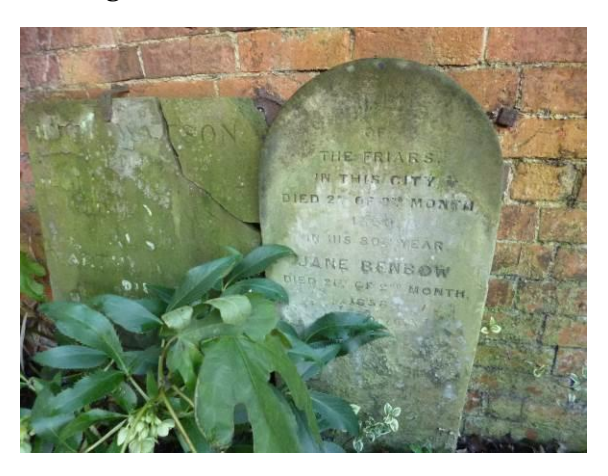
Fig.4: large grave slab to Celia Evans died Fig.5: Watson and Benbow grave markers 1845