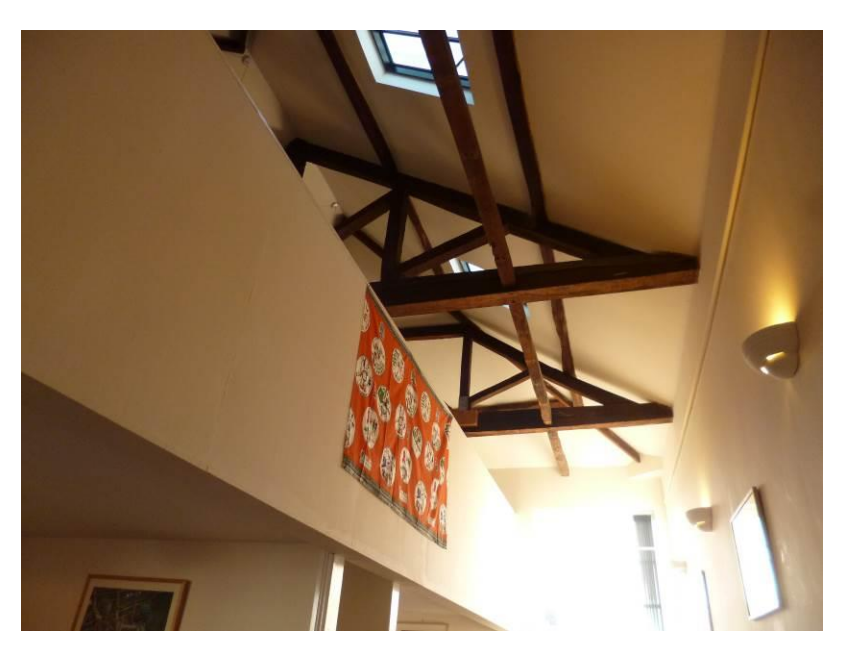
Fig.2: exposed roof in south range, from east (in office use)

Inside the meeting house has been altered with inserted partition walls and suspended ceilings which obscure some of the historic details and hindering interpretation. The main meeting room has a carpeted solid floor, a suspended ceiling and is lit from the north and west. It retains some early nineteenth century features including reeded architraves and flush beaded panelling to the north wall (formerly the location of the ministers' stand). Other walls have tongued and grooved dado panelling, with some re-set flush panelling above. The main feature of the room is the very high gallery on the south and east sides, carried on slender cast-iron columns with a quatrefoil section, an unusual feature for a meeting house. The gallery is blocked off from the room, but the retained front has panels of gothic iron balustrading, possibly re-set from another building, such as a church. The smaller meeting room to the south of the main meeting room was formerly the women's meeting room and is lit by a large sash window from the west. It has some tongued and grooved dado panelling, a Tobin tube for ventilation and a twentieth century plaster cornice. On the first floor of the south range, the 4-bay roof structure with tie-beam trusses is partly exposed above the inserted mezzanine.