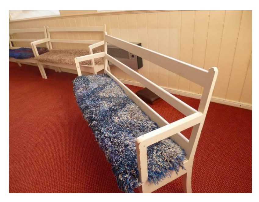
Fig. 3: painted pine benches in the meeting room